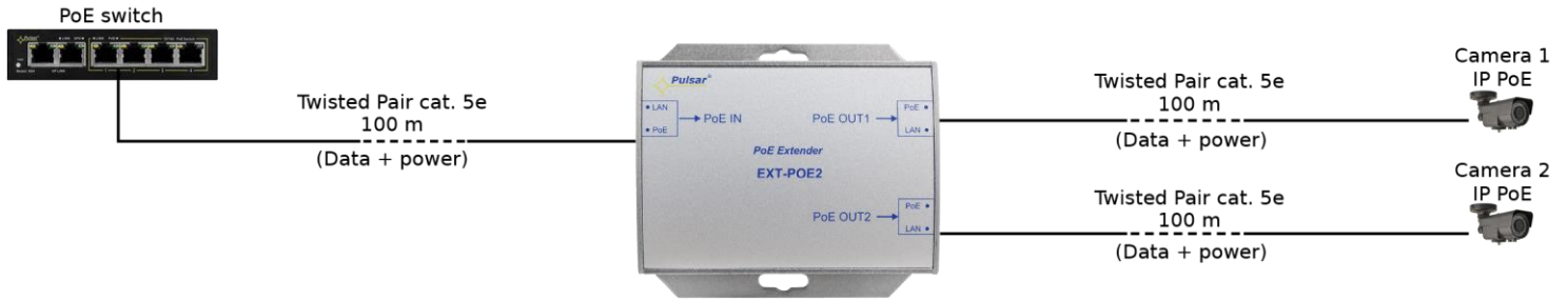
Connection of two IP PoE cameras and extension of the range for another 100m